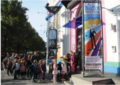
Buster 2008

with films at our new festival. Danish art is on the brink of a major international breakthrough and we hope we can help raise awareness around these extraordinary artists.'