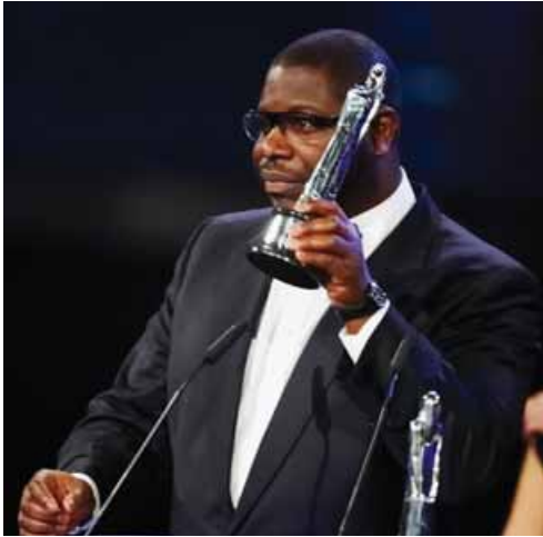
Steve McQueen European Discovery 2008 for Hunger

commitments prevented her from attending. Another English actress who was present, Dame Judi Dench, received one of the evening's largest ovations when she accepted the European Achievement in World Cinema.