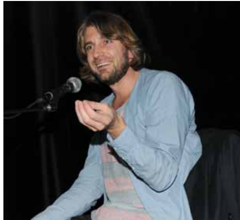
Anna Melikyan's Mermaid

The strong 2008 documentary section consisted of about 70 productions – half of the programme, and many of these were linked to educational purposes in schools, as well as panel discussions and seminars. To curate the programme content in different sections has become BIFF's hallmark. For instance, BIFF 2008 presented a special sidebar devoted