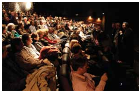
CPH:DOX 2008

GL Strand, the modern exhibition hall in the heart of Copenhagen, will for two weeks be transformed into an installation that will be part cinema and part exhibit. The FILM-ART-FILM project will reflect the challenging process the filmmakers and artists have gone through and how it has worked as a creative dynamo. The result will be exciting unpredictable fusions between the two artists, who each have a strong artistic expression themselves, but together they also become a manifest for the Danish creativity, innovation and high quality. 'We are thrilled to be able to present this unique project at CPH:PIX,' says Neiiendam. 'GL STRAND is famous for presenting audiences with new art and for putting art into new contexts and different framesets, not unlike what we will strive to do