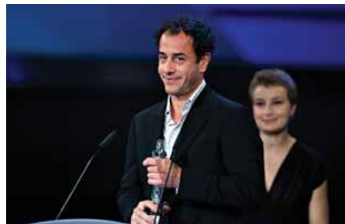
Matteo Garrone, European Director 2008 for GOMORRA

In the presence of Their Royal Highnesses The Crown Prince Frederik and Crown Princess Mary of Denmark, Danish Prime Minister Anders Fogh Rasmussen and EU Commissioner Viviane Reding, Danish news anchorman Mikael Bertelsen played host to the 1,400 guests gathered for the 21 st awards at the prestigious Copenhagen Forum. Guests presenting the awards included Marianne Faithfull (UK), Julia Jentsch (Germany) and Paprika Steen (Denmark), as well as Andrzej Chyra (Poland), Mads Mikkelsen (Denmark) and Santiago Segura (Spain).