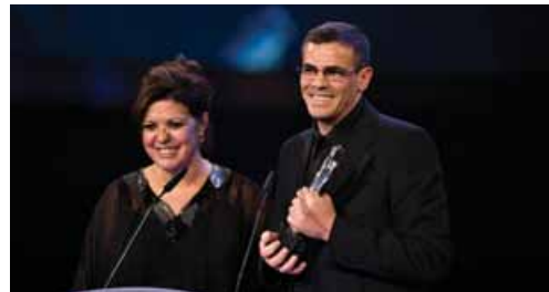
Abdellatif Kechiche, European Film Academy Critics' Award 2008- Prix FIPRESCI for Couscous

The 2009 awards ceremony will take place in Essen, in Germany's Ruhr region in North Rhine-Westphalia. The unique move is a change from the regular system that brings the European Film Awards to Berlin, home of the European Film Academy, every two years. In the years in-between the awards ceremony is held in different European film capitals such as London, Paris, Rome, Barcelona, Warsaw and now Copenhagen. Berlin's contribution of the European Film Awards 2009 to Essen are a first highlight of the European Capital of Culture year 'RUHR 2010'.